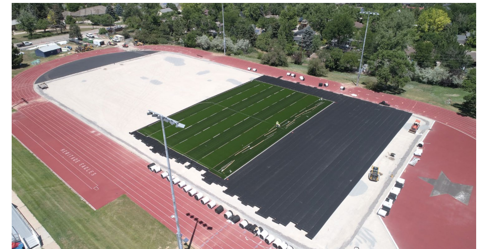
Heritage High School's grass field is being replaced with a safe and durable turf field. Each high school will have one lighted field. Photo taken July 2019.

This summer, the Ames Facility will be prepared for demolition so that a new elementary school can be built on the Ames campus. Construction on the new school will begin in the spring of 2020 with a projected grand opening in the fall of 2021.