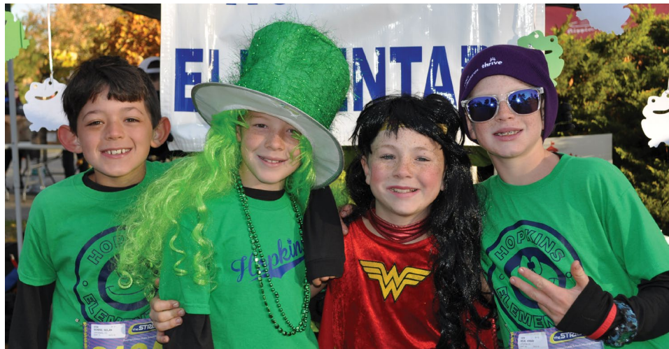
Students from Hopkins Elementary were proud to support their school at The Stride event last October. The 5k/10k run, hosted by the LPS Foundation, is a family focused event that raises funds for all LPS schools and is open to the public.

As Littleton Public Schools' fundraising partner, the LPS Foundation generates monetary resources and builds relationships in the community that enhance student experiences and successes in our neighborhood schools. Embracing another banner year, the LPS Foundation provided over $344,000 to LPS in support of innovative classroom grants and various high quality educational programs. Of particular impor-